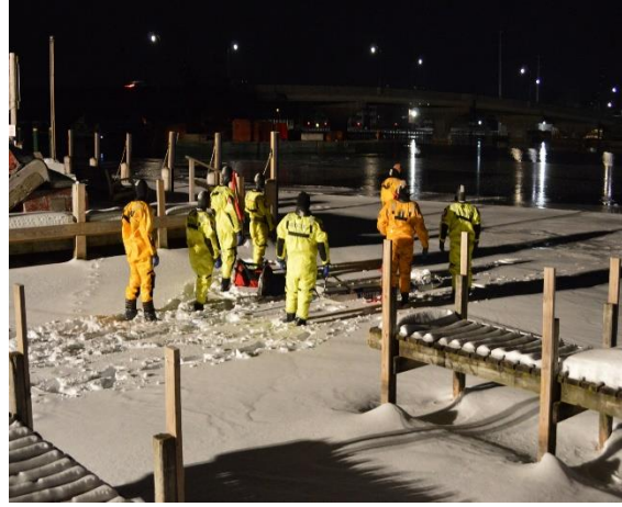
Shore-based Ice Rescue